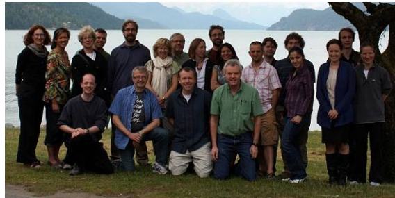
June 2011: Research retreat at Harrison Hot Springs resort