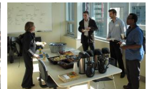
Pulse oximetry workshop participants