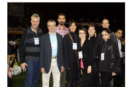
PART at the 2010 ASA annual meeting