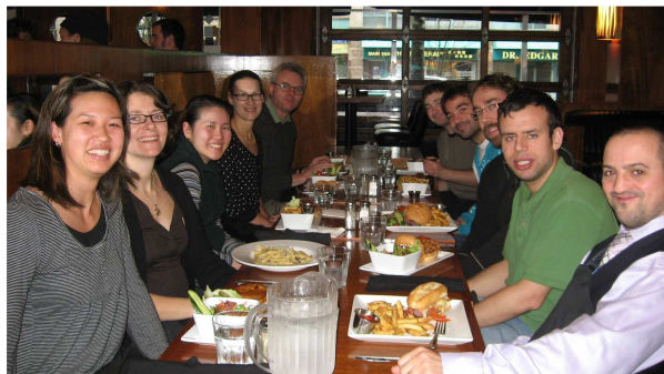
PART Christmas lunch December 2010